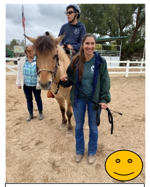
Correct leading position. Beside the horse's head!