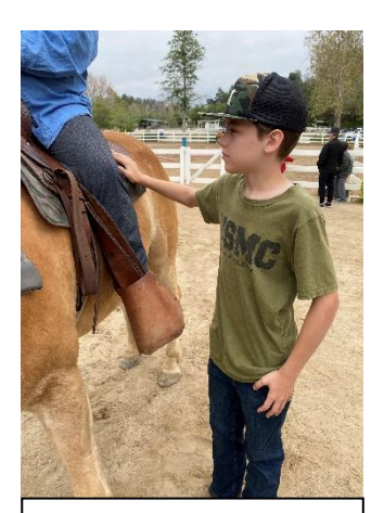
Correct spotting position