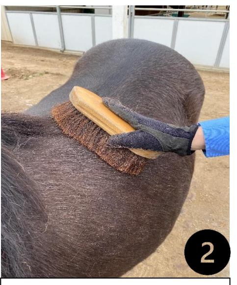
Use a brush to brush away any coat and dirt the curry comb has disturbed.