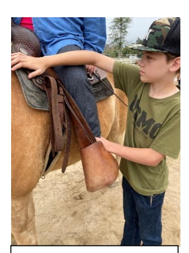
Correct arm over thigh and ankle hold