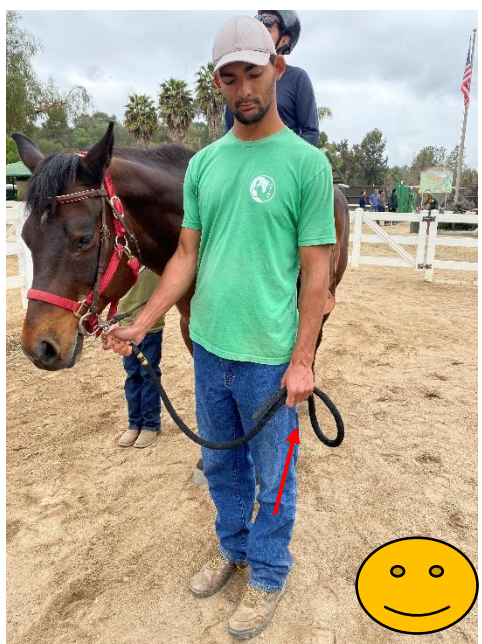
Correct way to hold a lead rope. Leader has the lead rope folded in their hand with none dragging on the ground.