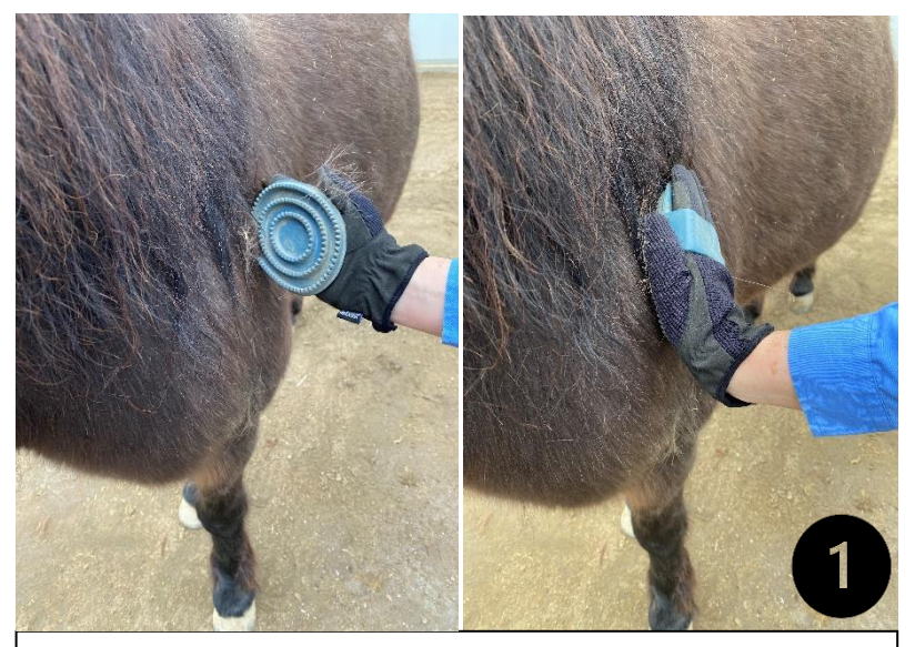
Begin by using a rubber curry comb applying gentle but consistent pressure against the horse's coat moving in circular motions. Do not use over bony areas.