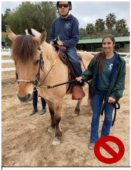
Incorrect leading method. Too far behind the horse's head.