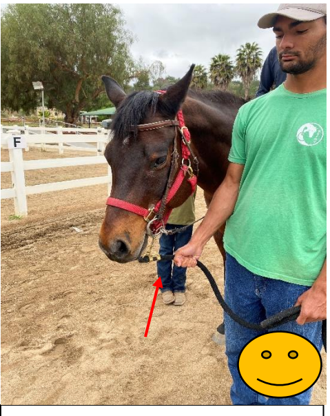
Correct way to hold a lead rope. Leader is not holding too close to the buckle or the horse's face.