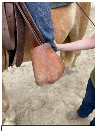
Correct ankle hold