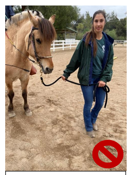
Incorrect leading position. Too far in front of horse's head.