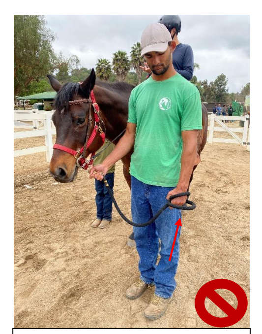
Incorrect way to hold a lead rope. Leader has wrapped the lead rope around their hand.