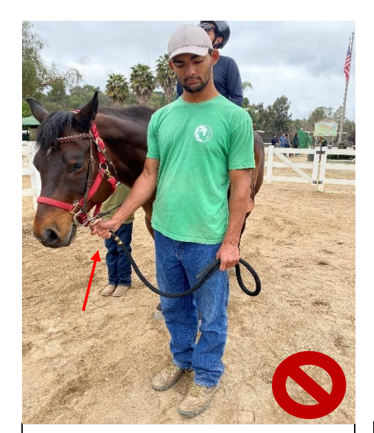
Incorrect way to hold a lead rope. Leader is holding the rope too close to the buckle and the horse's face.