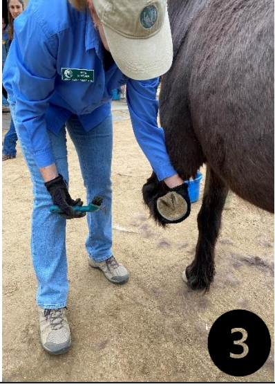
Use a hoof pick to pick rocks, manure, twigs and dirt out of the horse's hoof. Clean until the frog is visible and clear of debris, using the pick and brush. Hold the horse's hoof as indicated.

Be sure to go around the front of the horse to groom the other side!